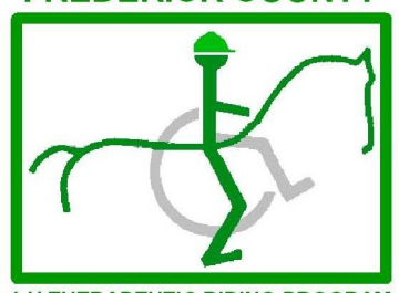
-H THERAPEUTIC RIDING PROGRAM