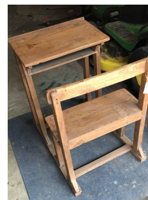
Antique Teak School Desk

Donated by Great Stuff by Paul (Valued at $475)