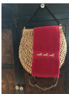
Basket Towel Holders