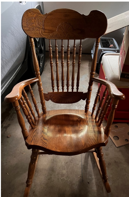
Full-sized Reproduction (Valued at $250)