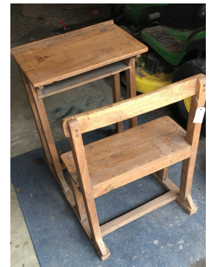
Antique Teak School Desk