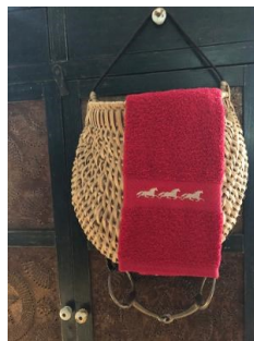
Basket Towel Holders