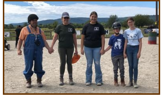
Saturday class leaving ring