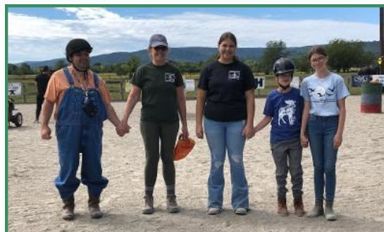
Saturday class leaving ring