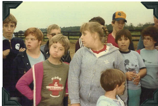
First FC4HTRP class