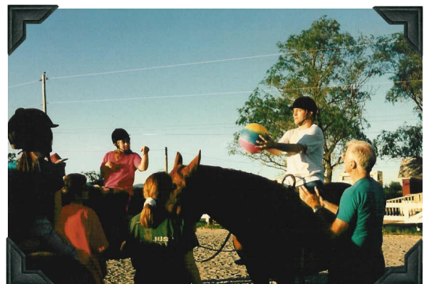
Fun with a ball