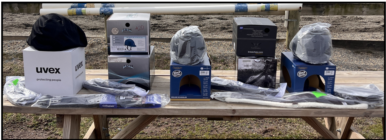
FC4HTRP purchases from THE MONOCACY FOUNDATION funds

We thank The Monocacy Foundation for their continued support of our program.