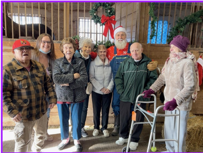
CHRISTMAS VISITORS AT SILVERADO