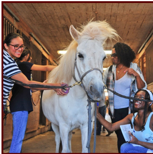
FUN AT FALL VOLUNTEER TRAINING

A Horse/Pony Buddy Schooling Book is maintained on the front desk of the barn. Buddies should consult the book. We must maintain a record to track what the horses have been working on, as well as their progress and results so far. So be sure to complete the Schooling Book .