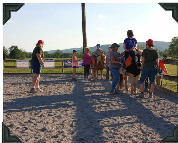
THURSDAY CLASS LINE UP